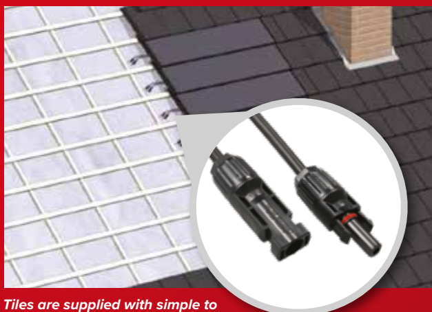
Tiles are supplied with simple to use standard “Plug In” MC4 connectors

The simple and quick installation makes the solar roof tile ideal for both new build and renovation projects.